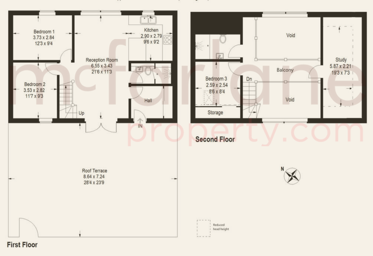
Illustration for identification purposes only, measurements are approximate, not to scale. FloorplansUsketch.com @ 2021 (ID810838)

Approximate Gross Internal Area (Excluding Void) = 107.12sqm / 1153sqft