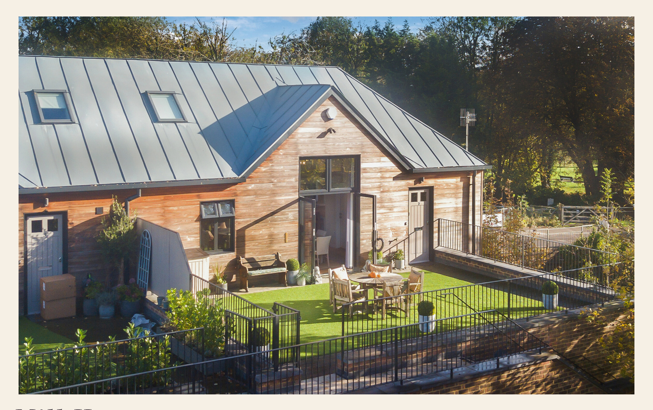
Mill House | Hilliers Yard | Marlborough Asking price of £525,000