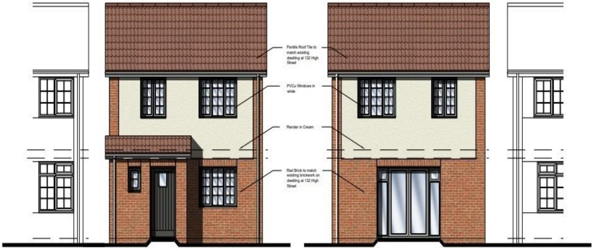
Front Elevation - 1:50 (North West)